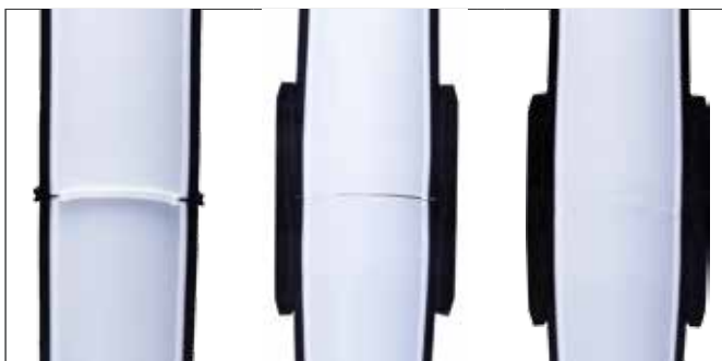
Heated element butt welding

In addition to the safe three-layer structure, MINELINE II can be connected using a combination of butt and electro-socket welding. This helps to avoid potential weak points and protects the inner pipe against abrasion.