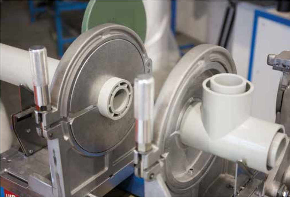
The AGRU Poly-Flo double containment piping system can be joined using time-saving simultaneous welding.