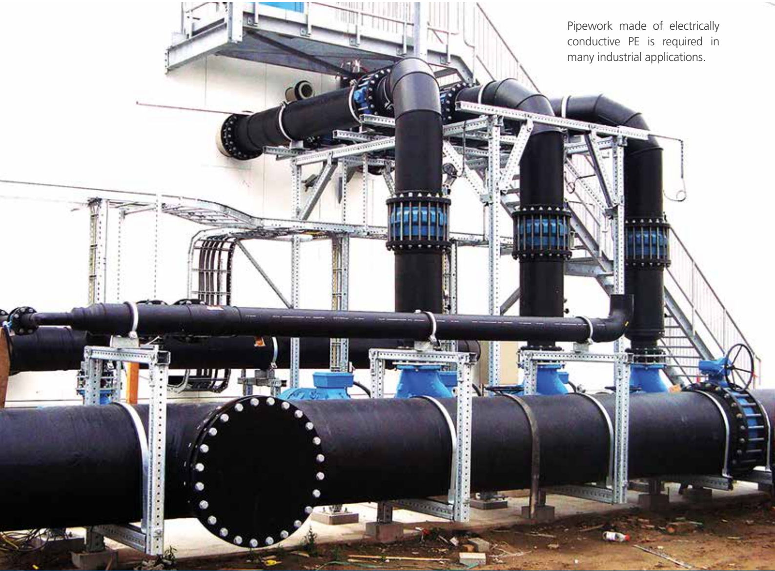
Pipework made of electrically conductive PE is required in many industrial applications.